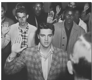
Elvis' birthday is January 8th.

Toastmasters- Achieving Greatness, TOGETHER!